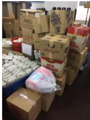
Through the cash donation from Brandix, water bottles were purchased from Cargills Ceylon PLC to be distributed to affected communities