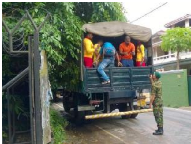
SVERT Team departing for rescue operations