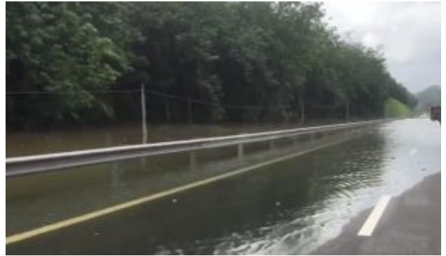
Southern Highway near Dodangoda