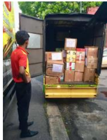
Cargills Ceylon PLC delivering water bottles to SLAF base