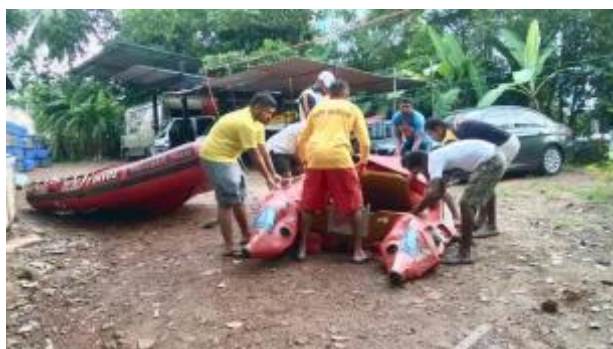
Boats been prepared for SAR operations